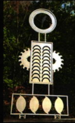
Metal Art Sculptures