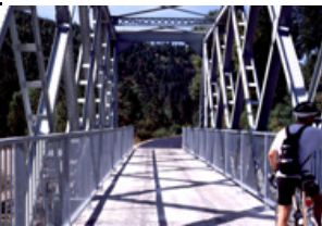
In the fall of 2002, all the railroad bridges were resurfaced for bikes and pedestrians.