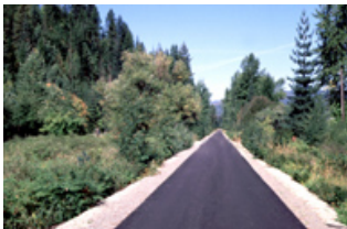
Most of the trail is far away from habitation, giving you solitude as well as exercise...so pack a lunch and a repair kit.