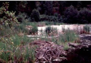
The small treasures you encounter along the Trail include beaver homes