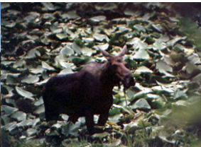
If you're lucky, you'll spot wildlife along the trail.