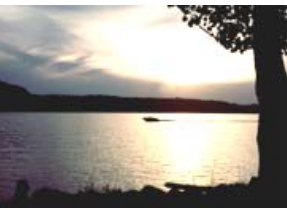
Biking along the shore of Lake Coeur d'Alene at dusk is naturally a high point of your adventures.

For more information about the trails, visit Friends of the Coeur d'Alene Trails Web Site— http://friendsofcdatrails.org/