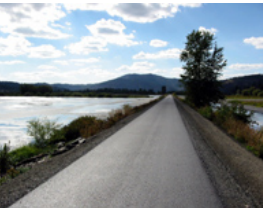
Straight, flat and well constructed, the bike path connects dramatically different places.