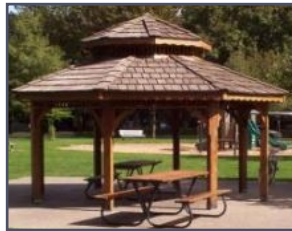
G.O Phippeny Park

Information on guidelines, rules and regulations can be found here . For more information on park shelters and reservations, call the Parks Department at 208-769-2252.