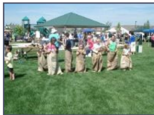
Sunshine Meadows Park