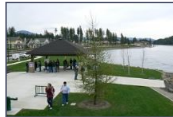
Johnson Mill River Park