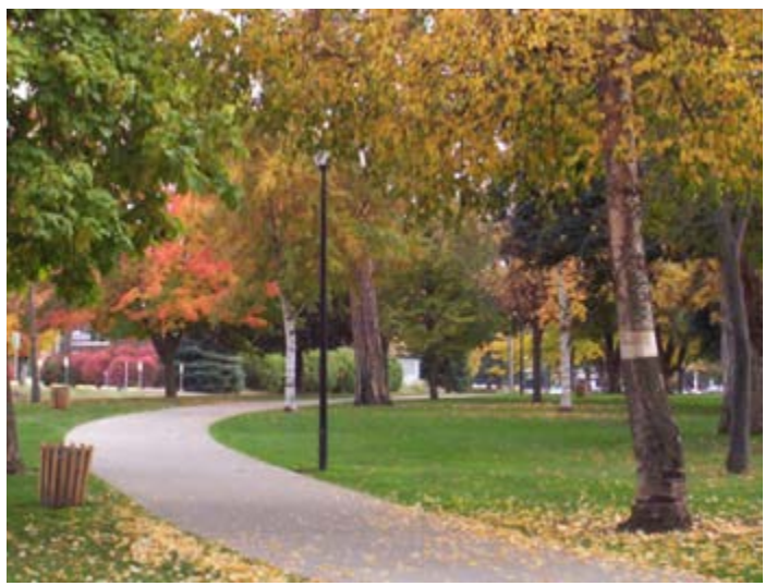
Stars at night Bicycle & pedestrian friendly open space

Promote bicycle and pedestrian connectivity and access between neighborhoods, open spaces, parks, and trail systems.